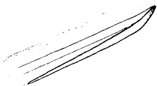
Typical Poa leaf

First: When you suspect you have a Bluegrass, check the leaves (please note: leaves - plural; just one is never safe). Hold a fresh leaf between your thumb and